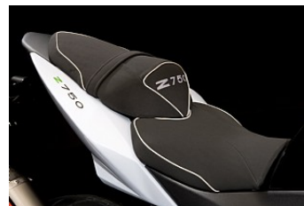
CUSTOM SEAT £ 194.95