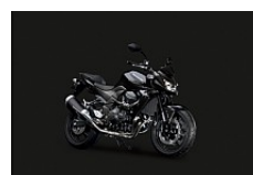
Metallic Spark Black