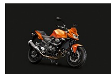
Candy Sparkling Orange