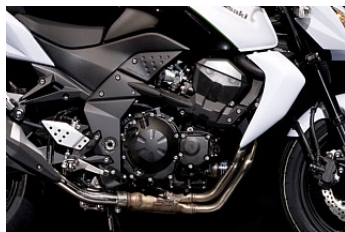
748cc supersports tuned engine