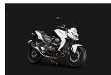
Pearl Stardust White / Metallic Spark Black

Price includes VAT at 17.5%, delivery to dealer and preparation of motorcycle. Government charges are charged in addition