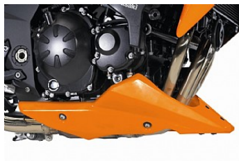
BELLY PAN £ 264.95