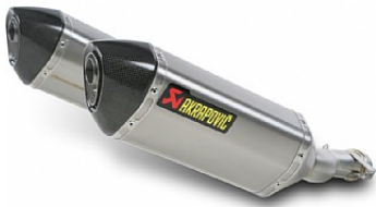
AKRAPOVIC EXHAUST* £ 982.95