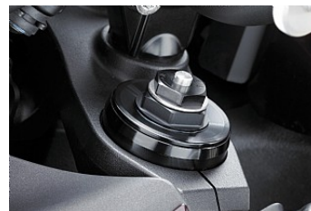
Fully adjustable front fork