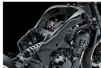
All-new Aluminium Twin-tube Frame