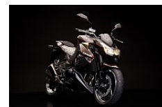
Metallic Chestnut Brown

Price includes VAT at 17.5%, delivery to dealer and preparation of motorcycle. Government charges are charged in addition