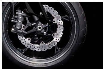
New 5-spoke cast wheels