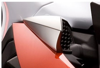
Cool Air System