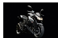
Metallic Spark Black / Atomic Silver