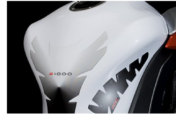
KNEE PADS £ 24.95