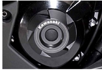
CRANK CASE RINGS £ 64.95