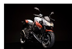
Pearl Stardust White / Candy Burnt Orange